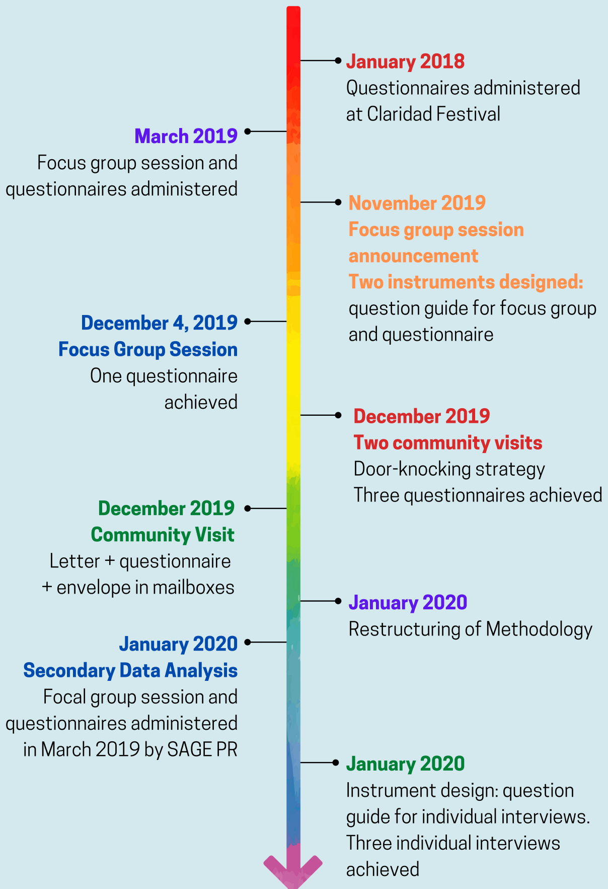
Figure 1. The TimeLine below reflects the different efforts completed until 2020.