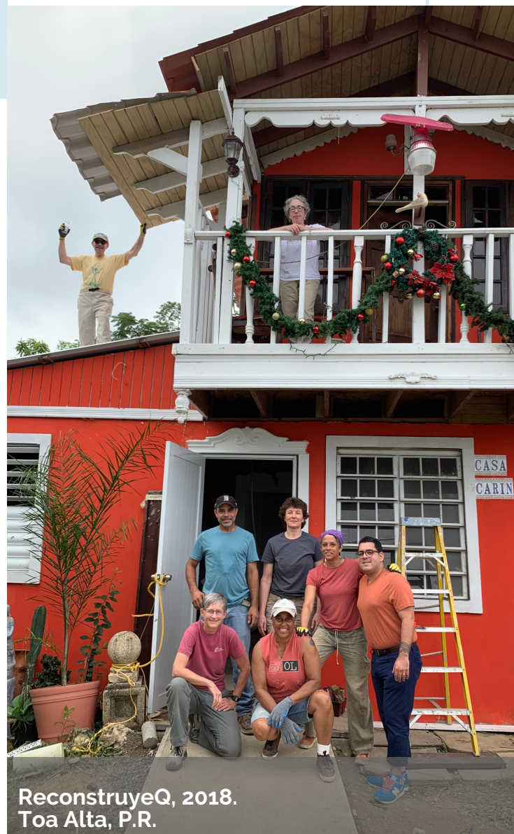
ReconstruyeQ, 2018. Toa Alta, P.R.